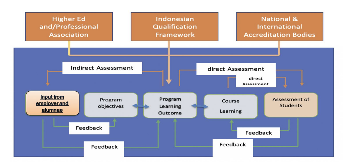
Table 6: Educational Objectives and Learning Outcomes Assessment System