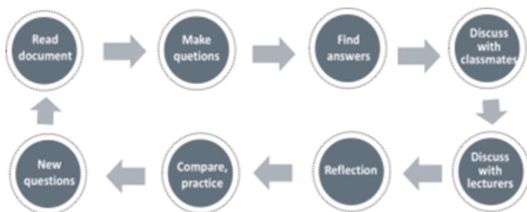
Figure 2 Teaching and learning activities at IER

To ensure that teaching and learning methods are implemented smoothly, the faculty carries out activities to orient and create a foundation for students to easily access teaching and learning methods by standards course output. IER conducted seminars with first-year students about effective learning methods. Moreover, training students on scientific research methods over the years. The course Introduction to International Economics is introduced in the first semester of the curriculum to equip students with foundational methods.